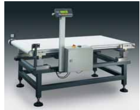
Weighing module WM60|WM120