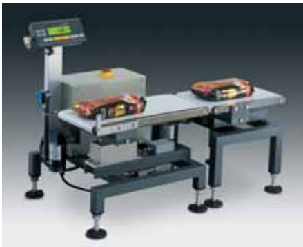
Weighing module WM6