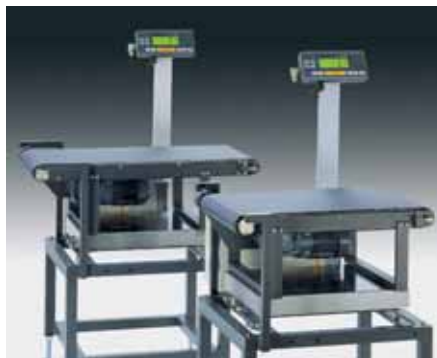
Weighing module WM35